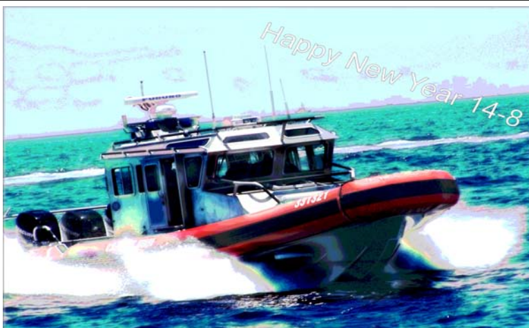
USCG 25-foot (8m) Defender –class boat