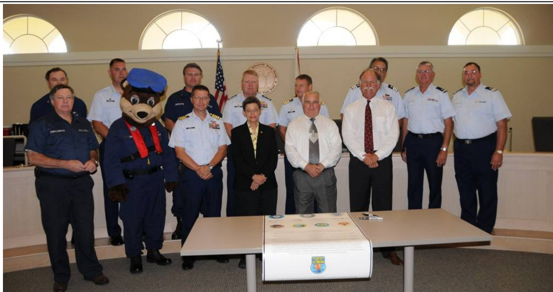
The Mayors of both Jacksonville and the Beaches kick-off the National Safe Boating Week Campaign by signing a Proclamation all together in one document, a first for Division 14.