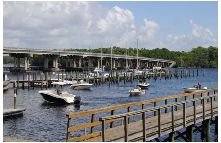
A busy day at Knight's Marina in Green Cove Springs on May 16 the first day of National Safe Boating Week and 14-8 was on hand to kick off the event with free Vessel Safety Checks