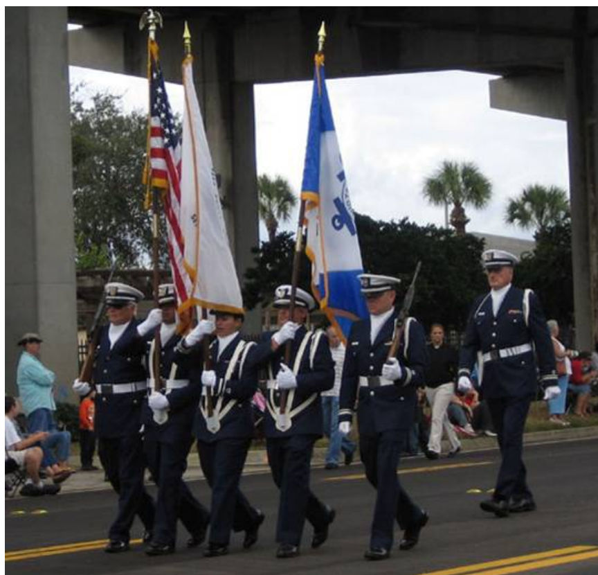
Division Honor Guard at the Veterans Day Parade