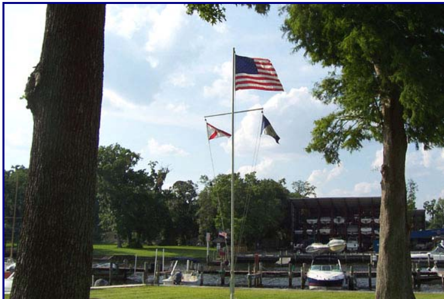
View of Goodby's Creek from Florida Tackle & Gun Club