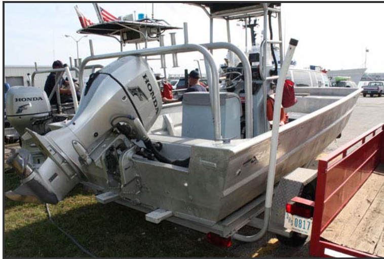
18 foot Coast Guard Boat to be used by TEAM WELAKA