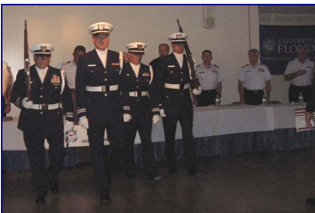
The Division 14 Auxiliary Honor Guard