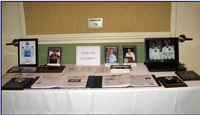
Flotilla 14-8 Display Table highlighting our history