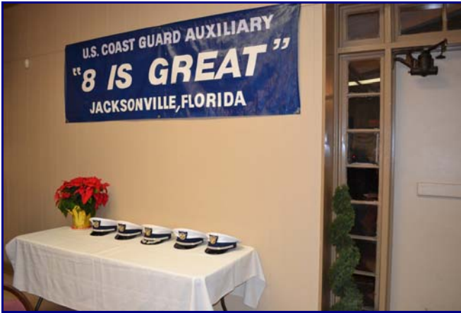
The Cover Table and our "8 IS GREAT" Banner