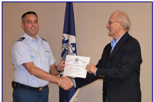
Many thanks to Ralph Little, for writing monthly articles for publication in the Mandarin Newline