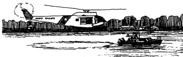
Sketch by Wilson Robertson, used on cover of Eight Bells January 1995