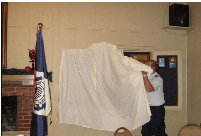
Time for the "Unveiling" on 03 January 2011.