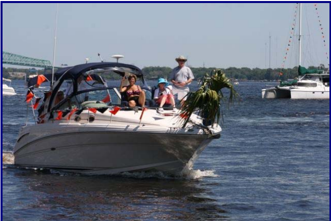
Little boats, big boats and everything in between lined up on the river for the Blessing of the Fleet.

Photos from BoatNorthEast.com. To see more images, go to: http://www.boatnortheast.com/photo/albums/blessing-of-the-fleet-2012