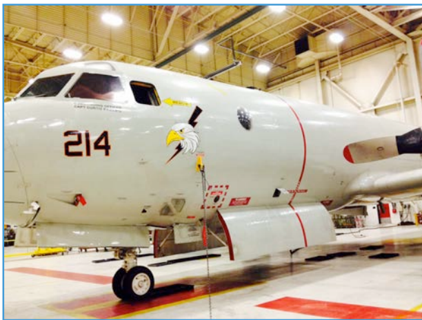
Navy P3 in its hangar.